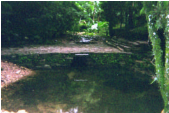
Figure F 4 – Palenque's only fully functional bridge, OT-B1.

After exiting OT-A1, a wall on the east side continues for 27 meters. The water then passes an extraordinary work of art. Positioned 1 meter above the flow of water sits