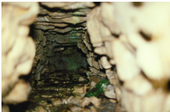
Figure C 4 – The interior of PB-A2.

After exiting PB-A1, the Piedras Bolas winds between the Xinil Pa' and Piedras Bolas Groups. The next water feature, PB-D1, is associated with structure X19. PB-D1 originates at the edge of the structure and flows west toward the Piedras Bolas. Its