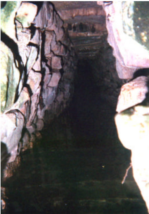
Figure H 1 – The interior of X-A1.

The Arroyo Balunte begins at an elevation of 208 meters separating Group C and the Ch’ul Na Group. The arroyo remains dry as it snakes between the Lik’in, Zutz’, and Xaman Groups. B-S1 is the Balunte’s first perennial spring and is located at 114 meters in elevation. Before entering X-A1 (Fig. H1), the streams only aqueduct, the Balunte is joined by a small perennial tributary fed by spring X-S1. These two watercourses enter the 11.48-meter aqueduct and together they continue in a northerly direction. Once inside X-A1, the stream collects more water from spring X-S2.