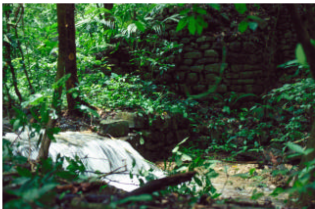
Figure D 1 – Water flowing over MT-DM1.

The Arroyo Motiepa is similar to the Piedras Bolas in that its origin is unknown. It enters the site boundary at an elevation of 216 meters. The Motiepa is fed by seven springs, six of which are perennial. The stream spans a distance of 800 meters to the north before leaving the site. Throughout its course it assists in creating boundaries for the Encantado Group, Encantado South, Xinil Pa', Group E, Moises Retreat, Group J, Motiepa Group, and Motiepa East Group.