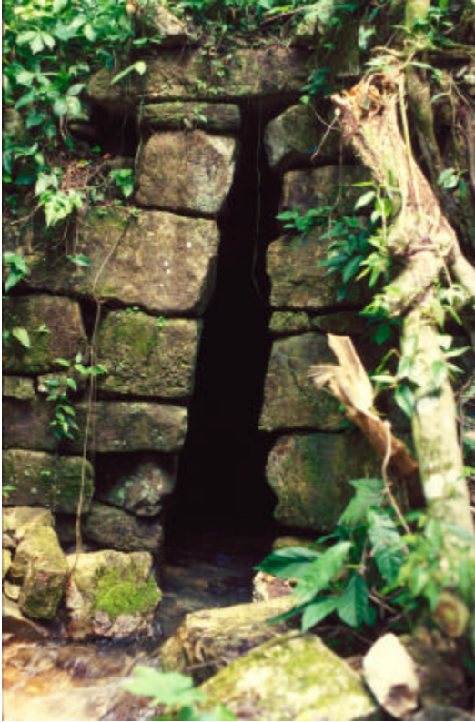
Figure B 1 – A view of P-A1’s exit.

The Picota Stream is fed by a total of 14 separate springs, 12 of which are perennial. The three springs that create the headwaters of the Picota are P-S2, P-S3, and P-S4. P-S2 has been modified with cut stones stacked in a crude circle. The stones create a small pool approximately 1 meter in diameter. As the waters from the three springs merge together they enter P-A1, the Picota’s first water feature (see Map B2). P-A1 travels 7 meters beneath a structure and is then joined by P-A2. P-A2 is delivering water from a small pool-like feature located 4 meters to the west of P-