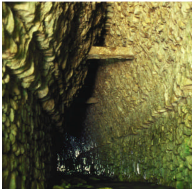
Figure F 2 – An interior view of Palenque’s most beautiful aqueduct, OT-A1. Notice the stone support beams found in the corbelled arch.

The PMP has discussed the possibility that OT-A1 had at one time extended further south to the edge of OT-C1, but the dimensions of the channel are too wide to support a corbelled arch. It is possible that the workers from the 1950's were forced to build the walled channel wider than its original foundation due to erosion. Excavations within the Otulum would help in verifying this theory.