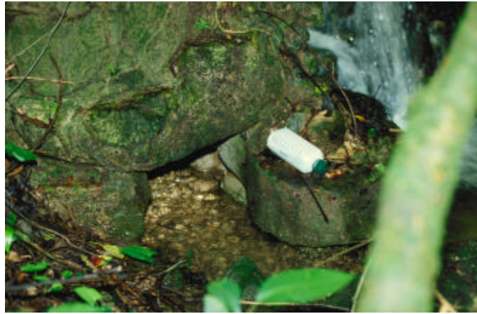
Figure C 2 – PB-A1's exit.

encounters as it flows north from the mountains. The true entrance to PB-A1 is unknown, but a collapse of roof stones revealed its interior. The main chamber of PB-A1 measures 1.20m in height by 80cm in width. This chamber of the aqueduct extends 4 meters from the collapsed roof. At this point, the aqueduct abruptly decreases in size by entering another chamber measuring 46cm x 46cm (Fig. C1). The smaller chamber then continues for 2.5 meters before terminating (Fig. C2). Today, due to the collapse, very little water passes through PB-A1. The majority of the water flow has been forced to the west of the aqueduct (Fig. C3). During the rainy season a massive quantity