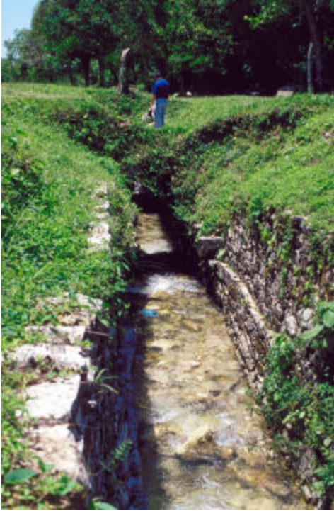
Figure F 1 – The Otulum flowing through OT-C1.

The OT-C1 stretches 97 meters before entering the OT-A1. It is believed that during Classic times, this walled channel was actually an aqueduct. Maps of Palenque created by early explorers illustrate that the Otulum did not flow through OT-A1. Blom states that the aqueduct was “blocked by its fallen roof”(Blom 1925:173). The collapse forced the Otulum to flow just to the east of the aqueduct and cut a “new” streambed. Blom’s map clearly shows the diversion of the stream began at the same location where the walled channel begins today (Map 3.8). During the 1950’s, archaeologists began to clean out the debris and rebuild the walls. After the collapse was cleared, the water from the Otulum split in two directions. The stream once again flowed through the aqueduct but continued to flow into its “new” channel. It was not until 1985 that archaeologists decided to block off the side flow of the Otulum and force all of the water back into the aqueduct. The “new” channel was filled with earth. Today the channel appears to have never existed.