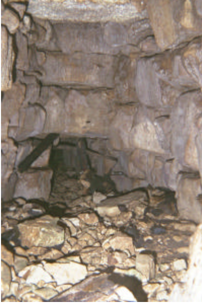
Figure C 1 – A view from inside PB-A1. Notice the decrease in size of the chamber.