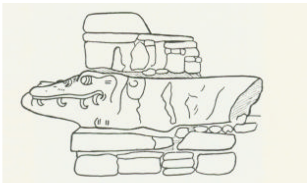
Figure F 3 – The carved alligator found at the exit of OT-A1. Frans Blom sketched this representation in 1923.

The intact section of OT-A1 is in beautiful condition and carries the Otulum 58.5 meters beneath the floor of the plaza (Fig. F2). It resides at an elevation of 187.50 meters. There is evidence of three separate construction phases of OT-A1. The earliest