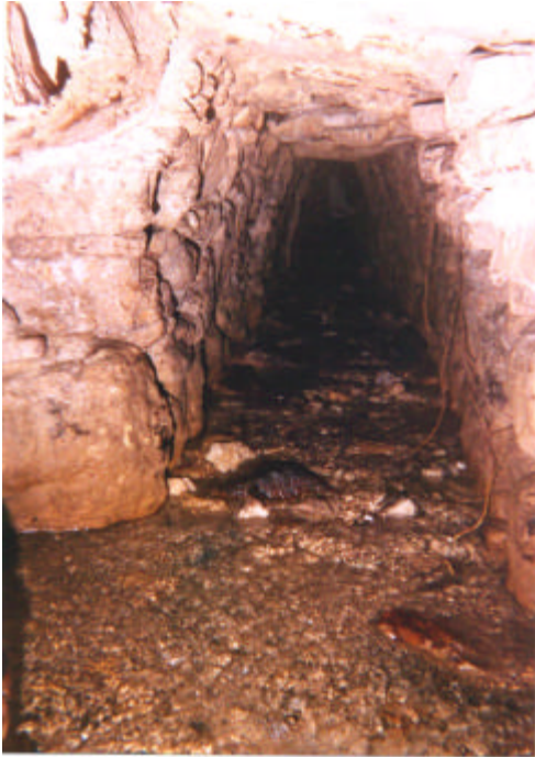
Figure F 6 – The interior of OT-A2. To the left please notice the exit of OT-A3.

gathers in a small and shallow natural pool. The water then enters a set of parallel aqueducts (see Map F3). OT-A2 has been obstructed from view by a large tree that grows directly atop the entrance. The Otulum waters still manage to find their way into the aqueduct. OT-A2 travels north at a bearing of 27 degrees for 19.4 meters before exiting into the natural streambed (Fig. F6). The second aqueduct, OT-A3, is heavily calcified and partially collapsed. Although damaged, the majority of the water flows through this feature. Both aqueducts have similar dimensions averaging 1.10 meters in height, and 80cm in width. The