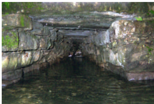
Figure F 5 – The vaulted channel that allows for water passage beneath the bridge.

an enormous alligator effigy (Fig. F3). It measures 3.44m in length, 1.10m in height, and 86cm thick, or about 3.50 cubic meters. When the Otulum was fully maintained by the Maya and clear of all debris the water level would have been substantially higher. This is also true