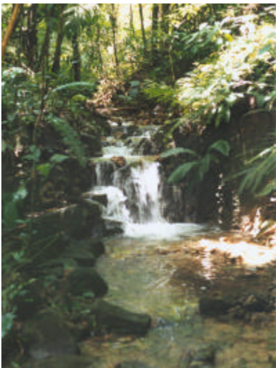
Figure C 3 – PB-A1 is located just to the left of the cascades.