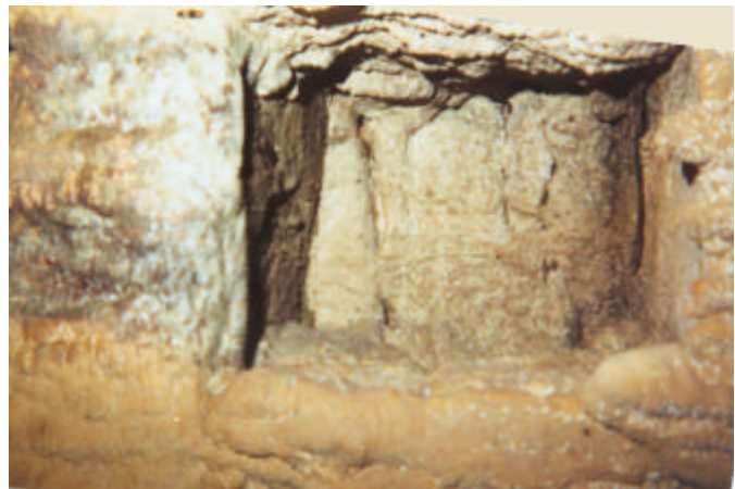
Figure F 7 – One of the niches found at the entrance of OT-A3.

At an elevation of 110 meters the stream