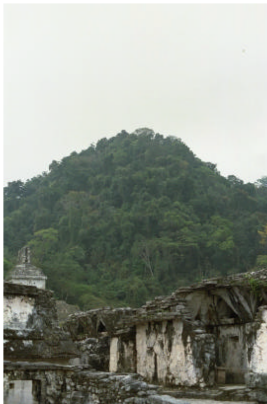
Figure G 1 – A view of El Mirador from the Palace.

The water flow in the southern region is seasonal. Judging by the dense