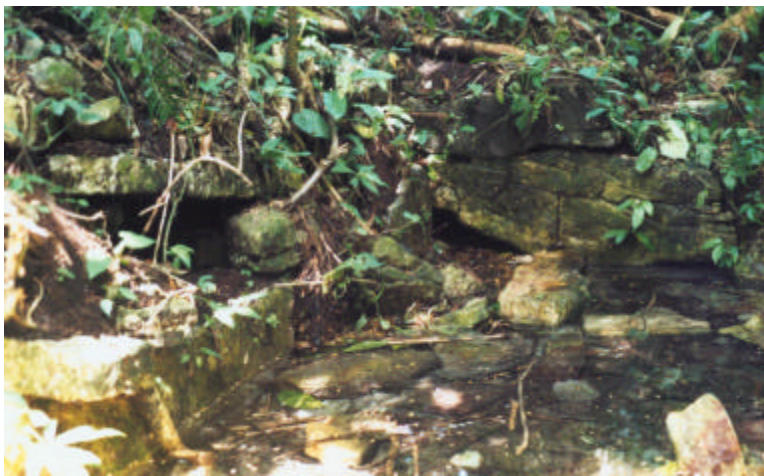
Figure C 6 – A view of PB-P1. The overflow drain is on the left edge of the photo.

The origin of the tributary is PB-S2, located 125 meters to the west of the Piedras Bolas. Similar to P-S5, PB-S2 is found in the southwest corner of a pool (see Map C2). The pool, PB-P1, is like the Picota's P-P1 in construction and appears to function the same way (Fig. C6). The overflow drain, PB-D2, is designed to bring the water from PB-P1 to PB-P2. The drain is 9.75 meters in length and fully intact. Although the water