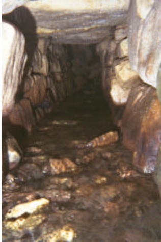
Figure B 2 – The interior of P-D1.

P-A1 and is positioned in the southeast corner. P-D1, measuring 30cm x 30cm, is fully functional and in excellent condition (Fig. B2). P-P2 is located just to the west of P-A1's exit. It resembles P-P1 in design, but preservation is poor. The dimensions of P-P2 are roughly 7.5m x 4.5m. Spring P-S6 is found in P-P2's southwest corner.