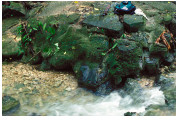
Figure D 2 – Notice the heavy calcification forming on all sides of MT-A1.

measures 8.18 meters in length, 1 meter in width, and roughly 1 meter in height. Today, MT-DM1 remains operational by slowing the flow of water in the Motiepa. The second feature is MT-A1, located 8 meters northwest of MT-DM1 (Fig. D2). This feature is given the title aqueduct for lack of a better term. MT-A1 is at an elevation of 189.17 meters and measures 4.5m x 1.5m. Due to heavy calcification, positive identification is difficult. Large cut stone slabs create the roof of the structure. By standing atop the aqueduct the sound of rushing water can be clearly heard. The source of the water from within is unknown. However, the water does exit through two small holes found on its west side. These holes were presumably drains at one time, but the dense calcification makes clarification difficult. Spring MT-S1 is located approximately 1 meter to the west of MT-A1.